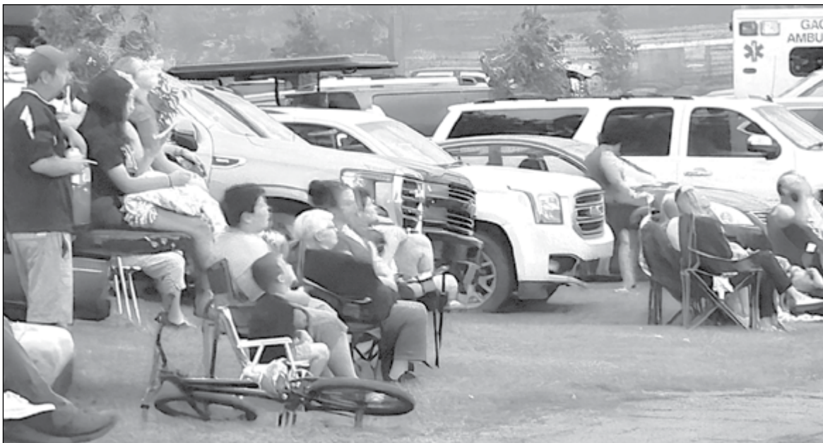
Families enjoy the fireworks show at Al Bye Memorial Baseball Field.